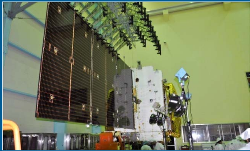
GSAT-18 undergoing Solar array Deployment Test

GSAT-18 is designed to provide continuity of services of operational satellites in C, Extended C and Ku bands. GSAT-18 is launched into a Geosynchronous Transfer Orbit (GTO) by Ariane-5 VA-231 launch vehicle from Kourou, French Guiana. After its injection into GTO, ISRO's Master Control Facility (MCF) at Hassan takes control of GSAT-18 and performs the initial orbit raising maneuvers using the Liquid Apogee Motor (LAM) of the satellite, placing it in circular Geostationary Orbit.