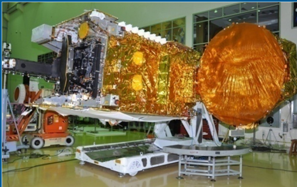
GSAT-18 in Clean Room

GSAT-18, India's latest communication satellite, is a high power satellite being inducted into the INSAT/GSAT system. Weighing 3404 kg at lift-off, GSAT-18 carries 48 communication transponders to provide Services in Normal C, Upper Extended C and Ku-bands of the frequency spectrum. GSAT-18 carries Ku-band beacon as well to help in accurately pointing ground antennas towards the satellite.