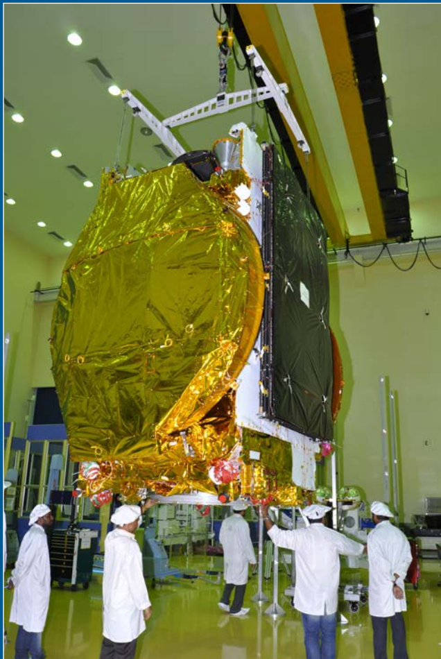
GSAT-18 being hoisted for a prelaunch test