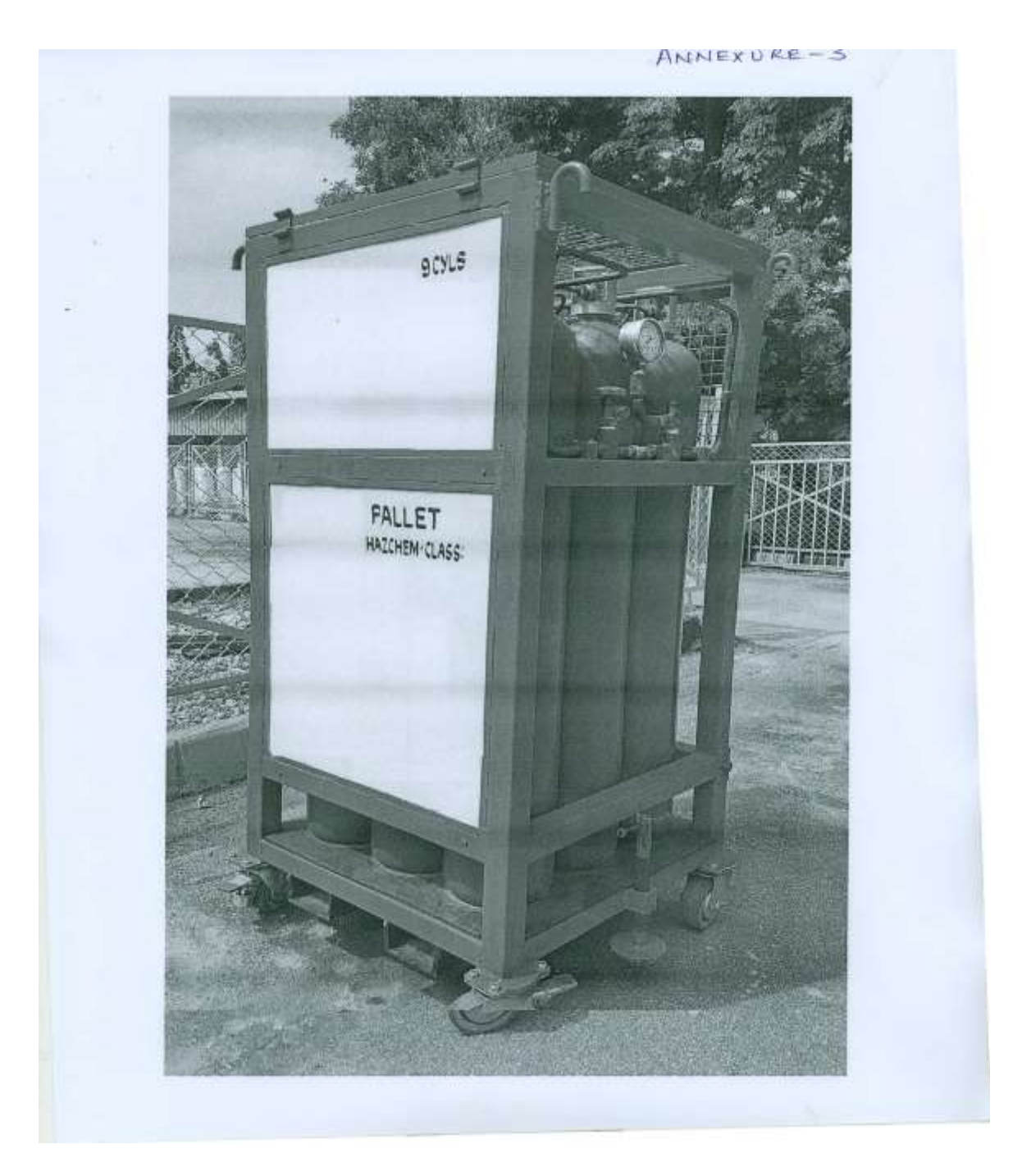
General arrangement of gas cylinders with Pallet